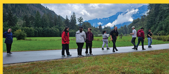
Young missionaries posting after morning Mass outside St. Patrick's Parish on our Community Day.

After listening to a vocation talk by one of the nuns, the group explored the holy ground. Photo taken at Queen of Peace Monastery, Squamish