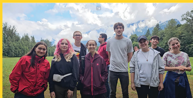
HotH missionaries in the Community Day

After listening to a vocation talk by one of the nuns, the group explored the holy ground. Photo taken at Queen of Peace Monastery, Squamish